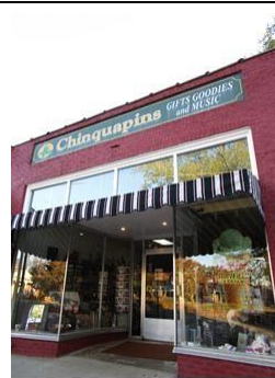
Chinquapins & Tigers, oldest family business in the County, completed new façade & storefronts in partnership with Town in 2017.