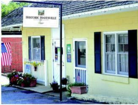
Town of Hayesville provides building for HHI Centennial Exhibit and STMS office.