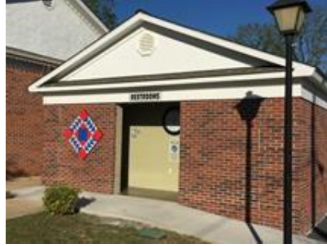
Town constructed public restrooms as part of STMS work plan.