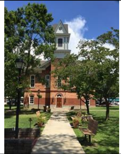
STMS/HHI donated over $16,000 to CCCRA for Historic Courthouse Restoration 2016-2017, completed in 2018 for over $1 million