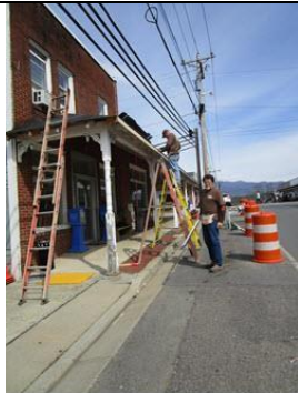
Façade improvements by local contractor for businesses with Town support for over $30,000 project in 2017.