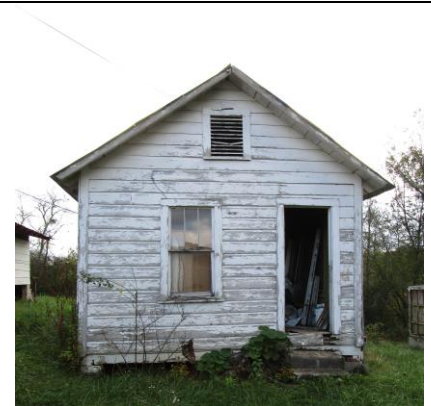
Hayesville's historic small Town Hall from 1950s has been donated to HHI for restoration beginning in 2019.